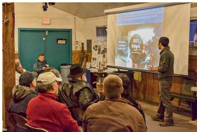
A packed house learns about the risks of oil transport.