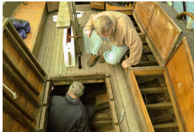
The Woody Restoration Team is working on an RFP package.

NEXT EXEC. COM. MEETING IS Tuesday, April 21st 7:00 p.m.