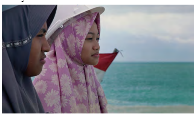
Fri, Nov. 22, 2019 Doors open at 6:45 PM Reception: 7- Film 7:30 McKinley Hall, 50 Liberty Street, Beacon,

Anyone wishing to join a Woody crew can contact any captain or Jim Birmingham to sign up. No experience is required. We will train you.